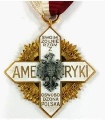
Polish Army Veterans Association of America District No. 2, Inc. 17 Irving Place New York, NY 10003