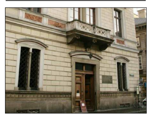
Polska Akademia Umiejętności ul. Sławkowska 17

This is a day trip that includes a funicular ride to the top of Mount Gubalówka with its beautiful panoramic views, time to explore traditional craft shops, the Tatra Museum, and the old wooden village of Chocholów before journeying back to Kraków. Tours depart at 8.45 am from the bus park at 11 Powiśle Street, opposite the Sheraton Hotel or between 8:00 and 8:30 am if being picked up from a hotel.