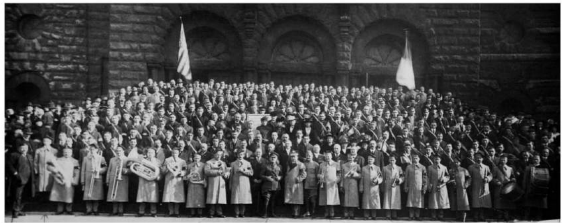
Departure farewell of the Chicago group of volunteers on October 1917

On the 100<sup>th</sup> anniversary of the War Effort of the Polish Emigration in America honoring the memory of over 20 thousand volunteers from USA and Canada to the Polish Army (Blue Army) in France 1917 to 1919.